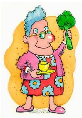
Have a cup of coffee or tea And get your veggies too

Vendors will be offering an array of items from baking, produce, crafts and so much more!